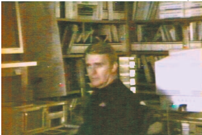
The Video Analyst<sup>TM</sup> System has the ability to stabilize, register, and zoom selected frame areas. This unprecedented method improves dark surveillance video with dramatic effect.