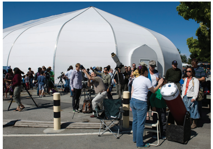
Amateur astronomers brought more than a dozen telescopes with solar viewing filters to NASA Ames Research Center on June 5, 2012 to view Venus cross in front of, or transit, the sun.

the online community. An example of a successful space-focused crowdsourcing effort is Galaxy Zoo, which already has hundreds of thousands of contributors from around the world classifying hundreds of thousands of galaxies using NASA's Hubble Space Telescope archive to help us understand how these galaxies, including our own, were formed.